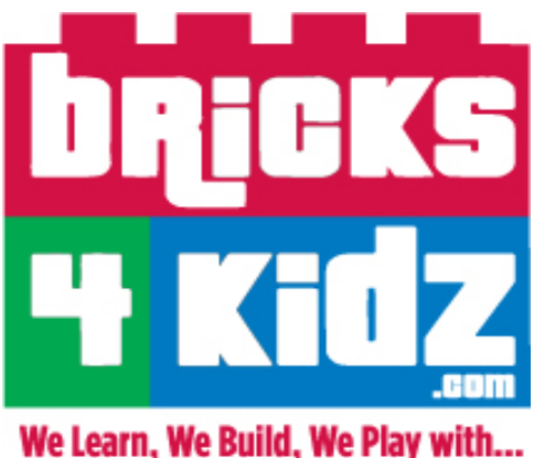
We Learn, We Build, We Play with... LEGO® Bricks